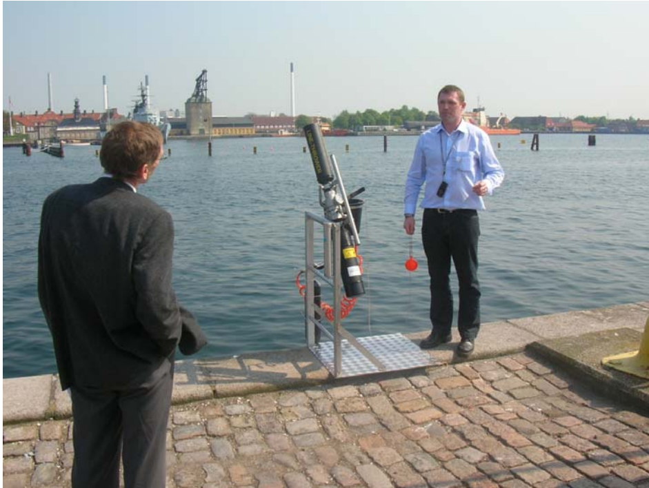
For demonstrations we use a mock up of a rail to show how to mount the linethrower.