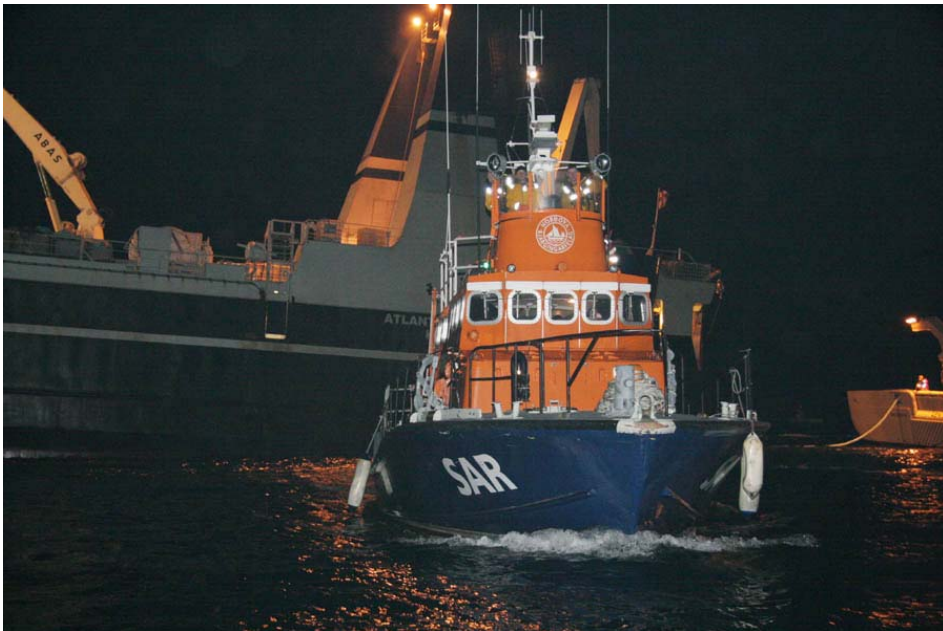
The Line-thrower is here used onboard a Faroese "Search and Rescue" vessel