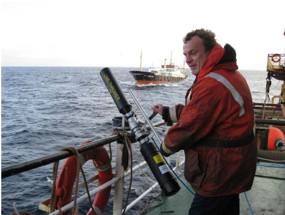
A line-thrower ready to throw a line to the next ship.